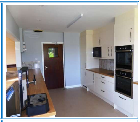
View towards kitchen door - double Neff ovens, Microwave & Fridge Freezer

Aylesbury Vale Community Chest is a community grants scheme run jointly by Aylesbury Vale District Council & the Vale of Aylesbury Housing Trust