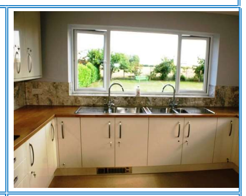
View through the rear window of the Kitchen