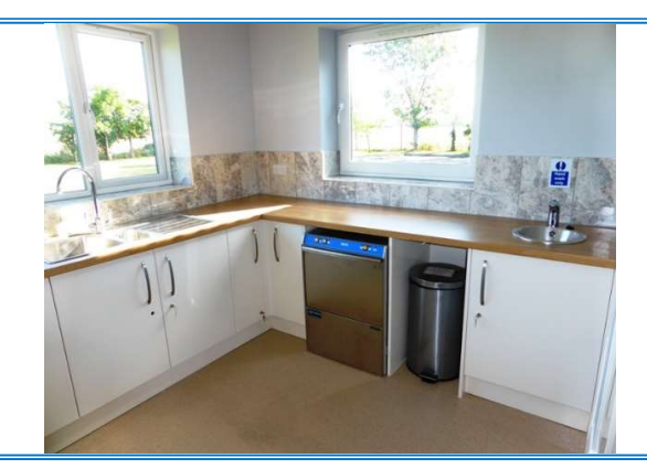
Commercial Dishwasher & hygiene hand wash

WREN is a not-forprofit business that awards grants for community, biodiversity and heritage projects from funds donated by FCC Environment through the Landfill Communities Fund