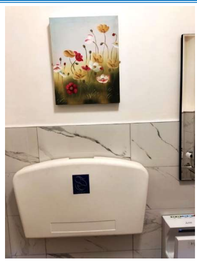
Baby Changing Facilities