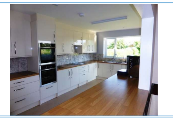
View through servery from the hall - double Neff Ovens & Neff Induction Hob

On 3<sup>rd</sup> September 2018, the extended and totally refurbished Kitchen was opened - making it probably the best village hall kitchen in Bucks, Beds & Herts!