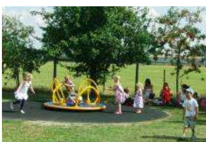
G Force Roundabout