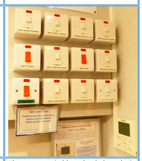
The master switchboard to help make it as easy as possible for Kitchen users new to the Hall