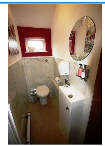
The Ladies' Toilets are especially bright and well equipped