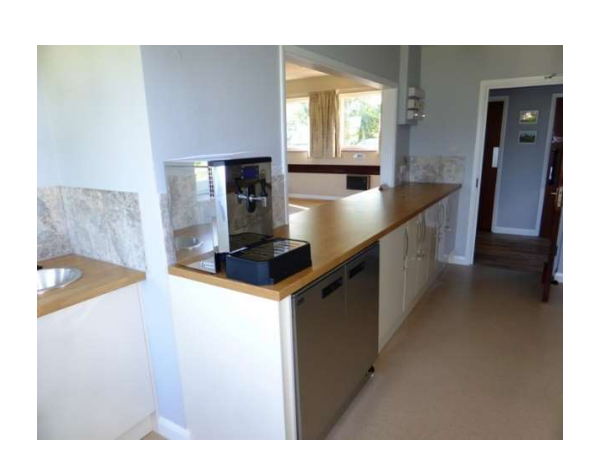
Burco auto fill Boiler, Warming Cupboard & spacious Servery

Aylesbury Vale Community Chest is a community grants scheme run jointly by Aylesbury Vale District Council & the Vale of Aylesbury Housing Trust