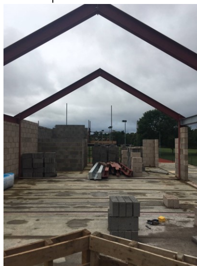
Upstairs taking shape.